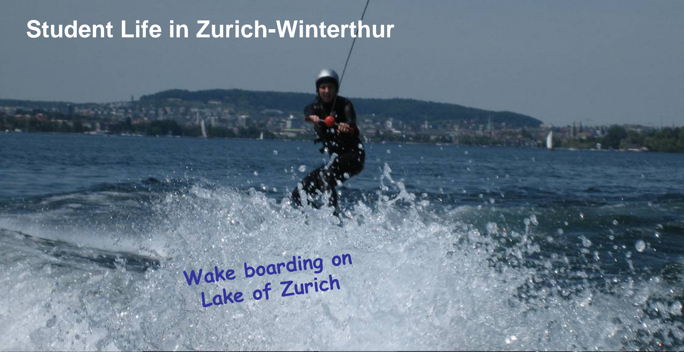
Wake boarding on Lake of Zurich